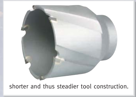
shorter and thus steadier tool construction.